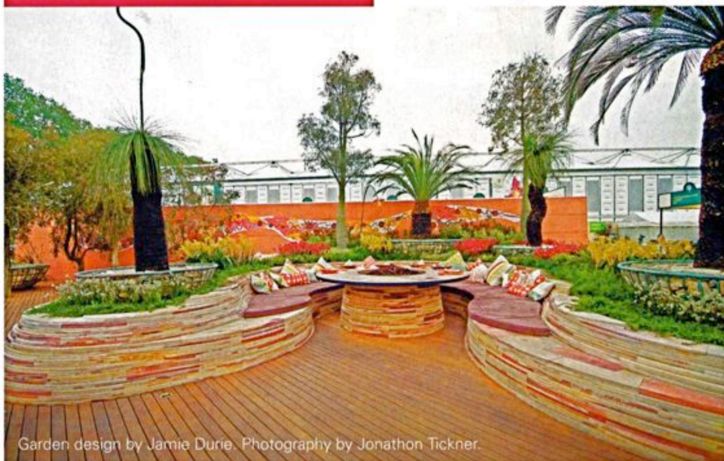
Garden design by Jamie Durie.

Mirror how you live indoors, outside. Comfort is key – make your outdoor space as comfortable and cosy as you can. Continue your interior colour, material and design scheme through to your outdoor space to create a flow in the overall design.